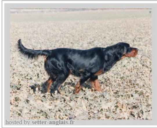
hosted by setter-anglais.fr

(M) VDH/DPSZ33/87 Qualifications: CHIT CHDE.T / Dyspl.: A Kennel