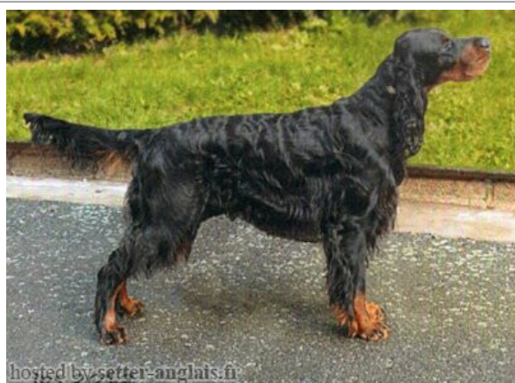
hosted by setter-anglais.fr

(M) KCSB-0977-CU Titres : CHGB.B / Dyspl. : A fiche affixe